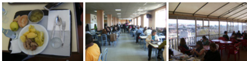
Figure 3: The canteens offer cheap food