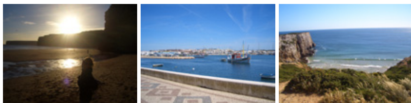
Figure 7: Praia Beliche (Sagres) and Harbor in Lagos