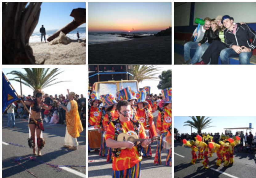
Figure 4: Carnival and Beach in Figuera da Foz