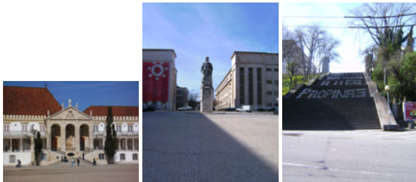
Figure 1: The Campus of the University Coimbra

The university was founded in 1290, though in fact Coimbra only became its permanent home in 1537. The city was also Portugal's capital in the 12 th and 13 th century. There are 3 parts, called Polo's. I studied at Polo II (Sciences and Technologies), only the Language Preparation course was at the Faculty de Letras at the central part of the university.