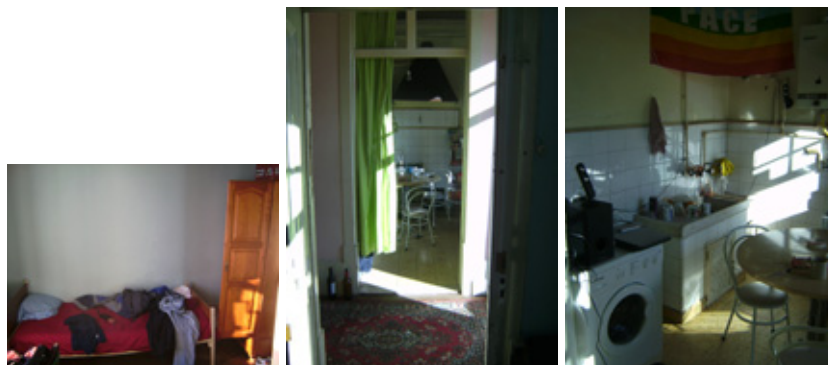
Figure 2: The Apartment