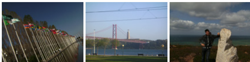
Figure 6: Lisboa: Ponte 25 de Abril, Cabo da Roca