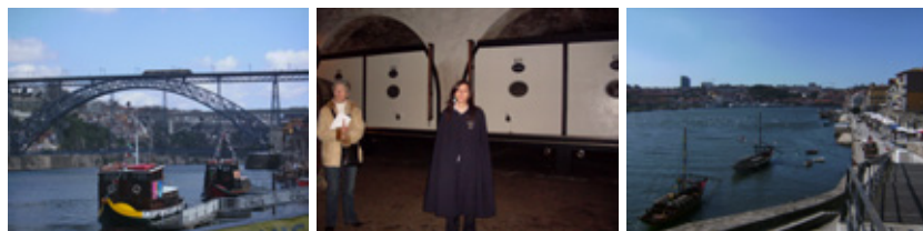
Figure 5: ESN Trip to Porto and Braga